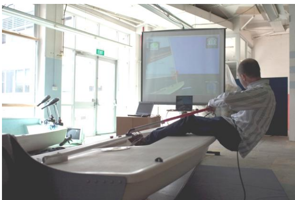
Figure 1 The VSail-Researcher sailing simulation classroom

The area showing the greatest numbers of participants is in learning to sail. Programs have been started within Australia for pre-teenagers through to university age students to learn to sail for the first time, adding simulation to the more traditional learning methodologies. The use of simulation in this area shows great promise for increasing participation and retention rates for the sailing industry as a whole.