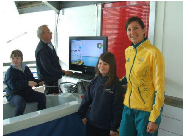
Figure 5 The VSail-Trainer being used to introduce school children to sailing